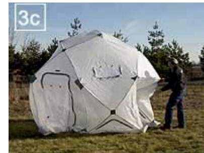
Step 3: Repeat Step 2 until all walls are popped out.