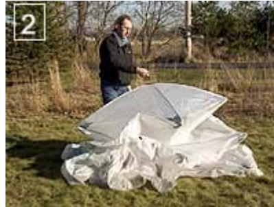
Step 2: Grab the center of the hub and pull the strap until the wall pops out.