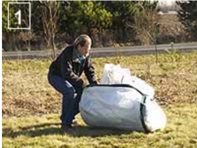
Step 1: Remove your DomeHouse™ from the pack.